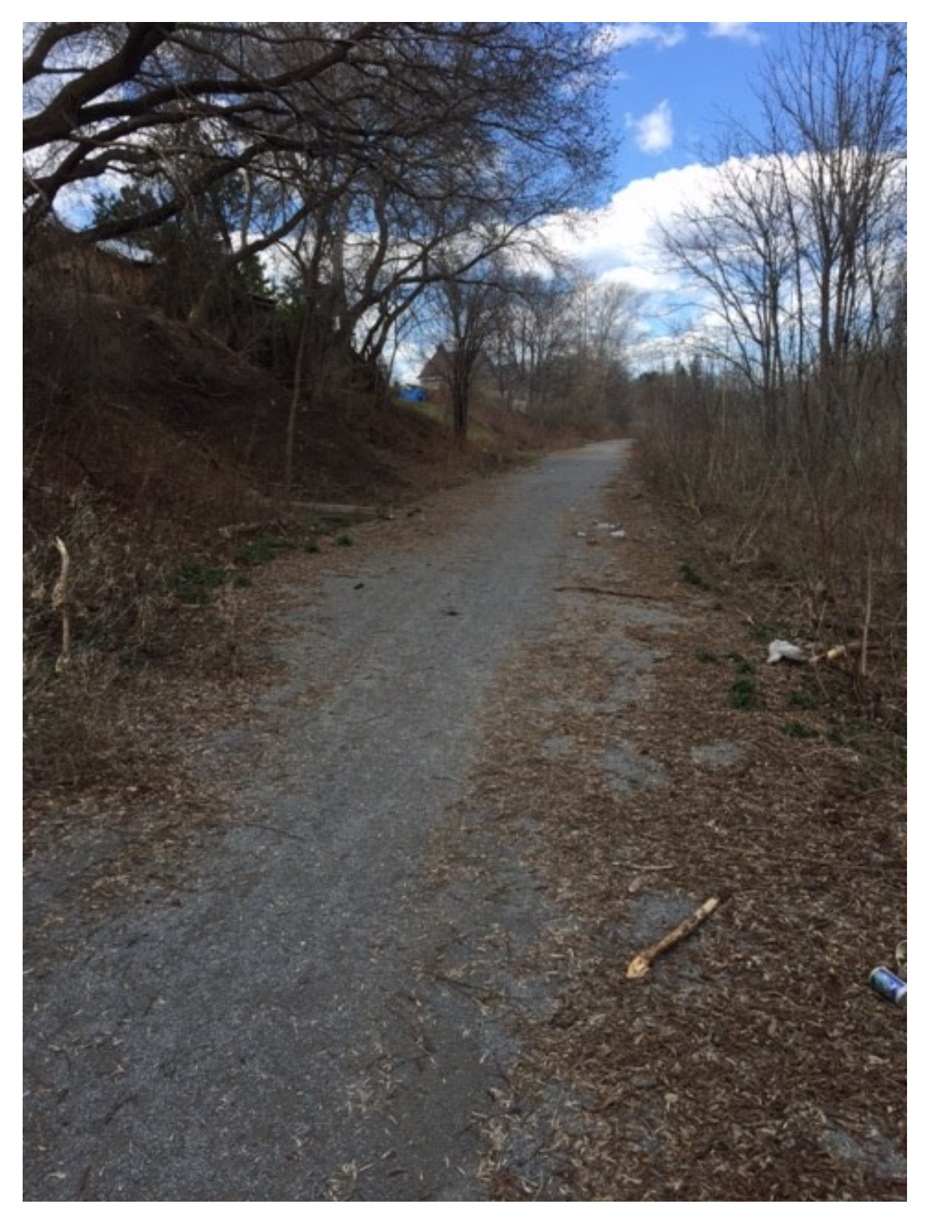
Liter observed between Pembroke St W and Munro St crossing.